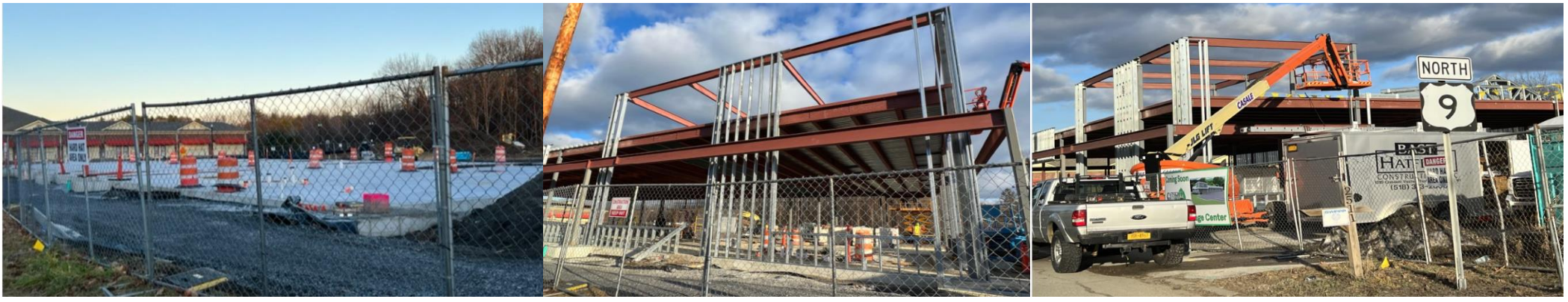
One Step Closer